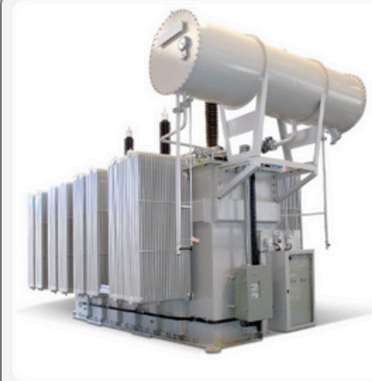
Power Transformer Tanks