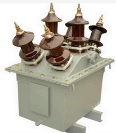
CT / PT Transformer Tank

We specialize in the fabrication of premium-quality mild steel tanks for transformers, leveraging our expertise and commitment to excellence. Our team of seasoned professionals possesses extensive experience in designing and constructing transformer tanks that align perfectly with the unique requirements of our clients.