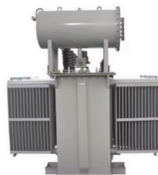
Distribution Transformer Tank